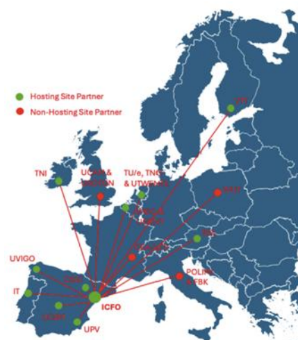
Figure 1 - Map of PIXEurope’s partners, including hosting and non-hosting sites, showing the centralised structure with a Gateway at ICFO, the coordinator.

PIXEurope is one of five pilot lines under the Chips JU, designed to create a standardized ecosystem for photonic integrated circuits (PICs). As PICs evolve—mirroring the trajectory of electronic integrated circuits (EICs)—they are expected to revolutionize sectors such as communications, artificial intelligence, and healthcare. Upon project completion, the PIXEurope pilot line is intended to be transferred to an industrial partner, as TNO’s long-term strategic roadmap does not include continued operation of the facility.