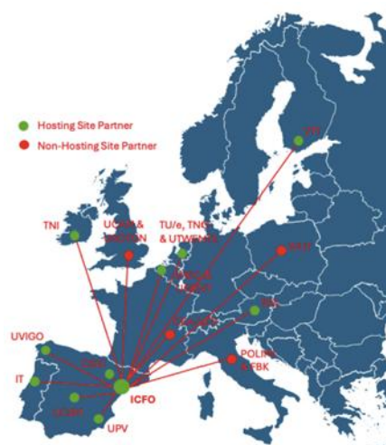
Figure 1 - Map of PIXEurope’s partners, including hosting and non-hosting sites, showing the centralised structure with a Gateway at ICFO, the coordinator.

PIXEurope is one of five pilot lines under the Chips JU, designed to create a standardized ecosystem for photonic integrated circuits (PICs). As PICs evolve—mirroring the trajectory of electronic integrated circuits (EICs)—they are expected to revolutionize sectors such as communications, artificial intelligence, and healthcare. Upon project completion, the PIXEurope pilot line is intended to be transferred to an industrial partner, as TNO’s long-term strategic roadmap does not include continued operation of the facility.