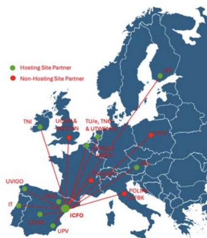
Figure 1 - Map of PIXEurope’s partners, including hosting and non-hosting sites, showing the centralised structure with a Gateway at ICFO, the coordinator.

PIXEurope is one of five pilot lines under the Chips JU, designed to create a standardized ecosystem for photonic integrated circuits (PICs). As PICs evolve—mirroring the trajectory of electronic integrated circuits (EICs)—they are expected to revolutionize sectors such as communications, artificial intelligence, and healthcare. Upon project completion, the PIXEurope pilot line is intended to be transferred to an industrial partner, as TNO’s long-term strategic roadmap does not include continued operation of the facility.