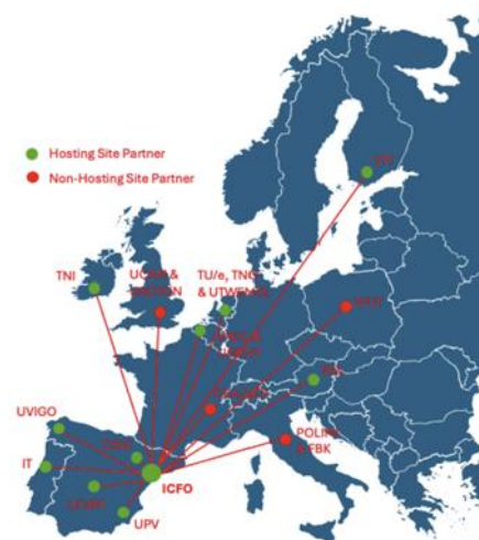
Figure 1 - Map of PIXEurope’s partners, including hosting and non-hosting sites, showing the centralised structure with a Gateway at ICFO, the coordinator.

PIXEurope is one of five pilot lines under the Chips JU, designed to create a standardized ecosystem for photonic integrated circuits (PICs). As PICs evolve—mirroring the trajectory of electronic integrated circuits (EICs)—they are expected to revolutionize sectors such as communications, artificial intelligence, and healthcare. Upon project completion, the PIXEurope pilot line is intended to be transferred to an industrial partner, as TNO’s long-term strategic roadmap does not include continued operation of the facility.