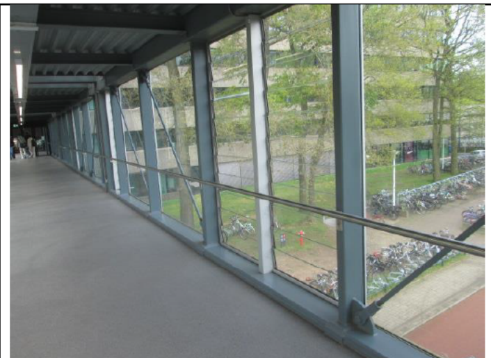
Louvre panels for make up air (in combination with the smoke hatches)