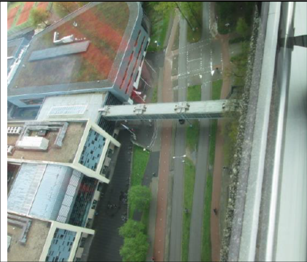
At the other side of the road the Gymnasion. Photo taken from the Erasmus tower. In between the overhead corridor.