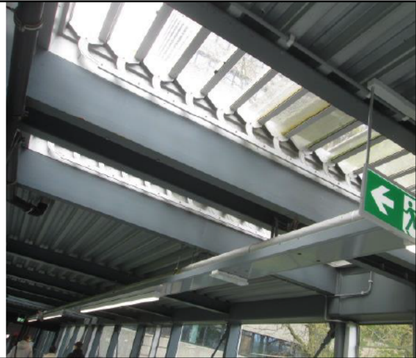
The smoke hatches in the corridor to the Gymnasion.