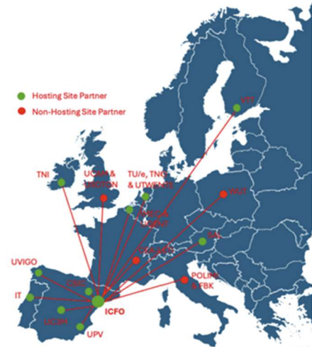
Figure 1 - Map of PIX Europe’s partners, including hosting and non-hosting sites, showing the centralised structure with a Gateway at ICFO, the coordinator.

PIXEurope is one of five pilot lines under the Chips JU, designed to create a standardized ecosystem for photonic integrated circuits (PICs). As PICs evolve—mirroring the trajectory of electronic integrated circuits (EICs)—they are expected to revolutionize sectors such as communications, artificial intelligence, and healthcare. Upon project completion, the PIXEurope pilot line is intended to be transferred to an industrial partner, as TNO’s long-term strategic roadmap does not include continued operation of the facility.