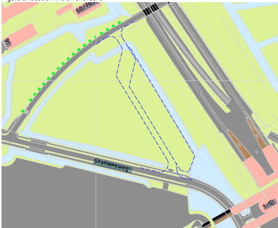
Figure 2: location near station (green dot)