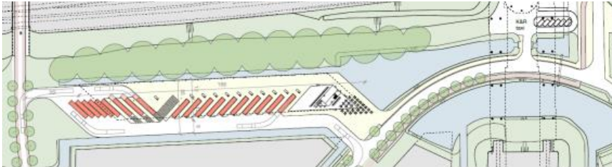
Figure 3 Indicative design of the site